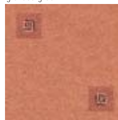
187/28028 elda spice