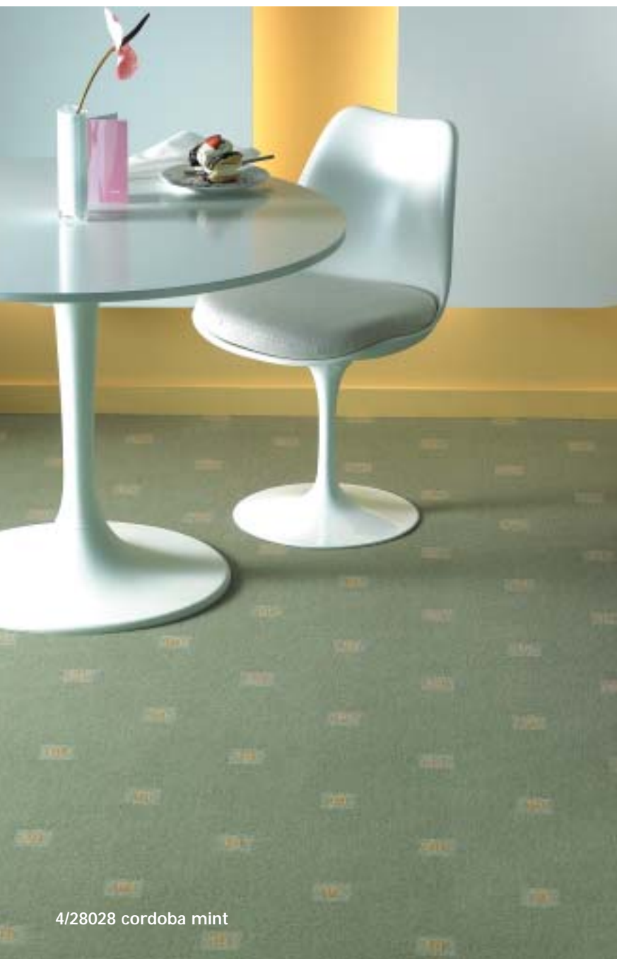
4/28028 cordoba mint