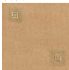
136/28028 toledo sand