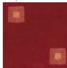
47/28028 segovia red

design no. repeat down repeat across match © 28028 0.343m (13 1/2") 0.333m (13 1/7") self ©2002