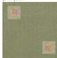
14/28028 granada green