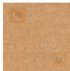
176/28028 cadiz gold