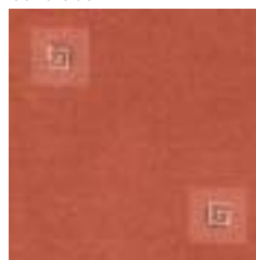
27/28028 sierra tan