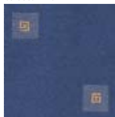
203/28028 denia blue