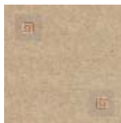
64/28028 lorca olive