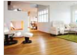
9 More space, more comfort