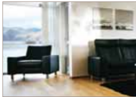
7 Co-ordinating Stressless® comfort