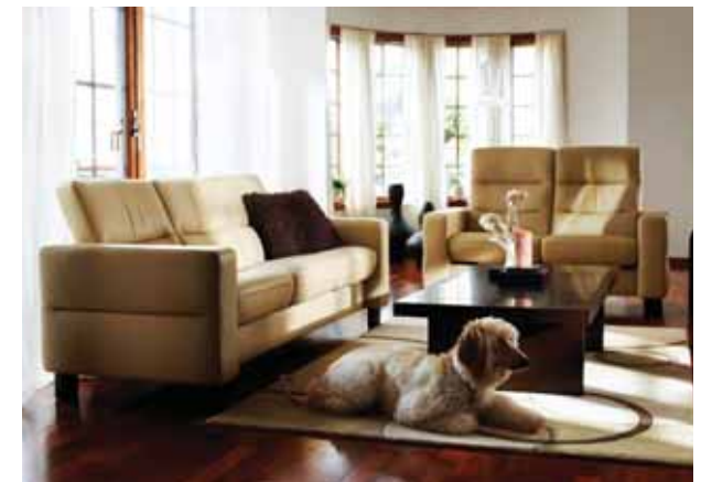
Stressless® Wave high back 2 seater and low back 3 seater reclining sofas.

Five individually adjustable seats – two high backs and three low backs, with a fabulous big corner in the middle. With all these combinations you'll never want to get up.