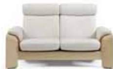
Stressless® Pegasus high back reclining 2 seater sofa.