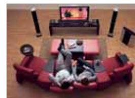
13 Sound and vision