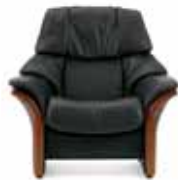
Stressless® Eldorado chair.

Stressless® Granada and Stressless® Eldorado are the same design but different in width. If you like the look, check the measurements in our latest brochure.