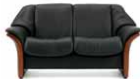
Stressless® Eldorado 2 seater sofa.