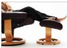
11 Tilting footstool for extra comfort