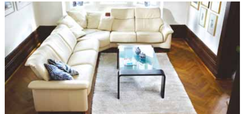
Stressless® Paradise medium corner roomset.

Wooden front panels are optional. Choose from seven different colours.