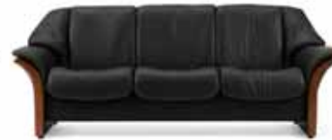
Stressless® Eldorado 3 seater sofa.