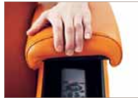
8 Comfort is being in control