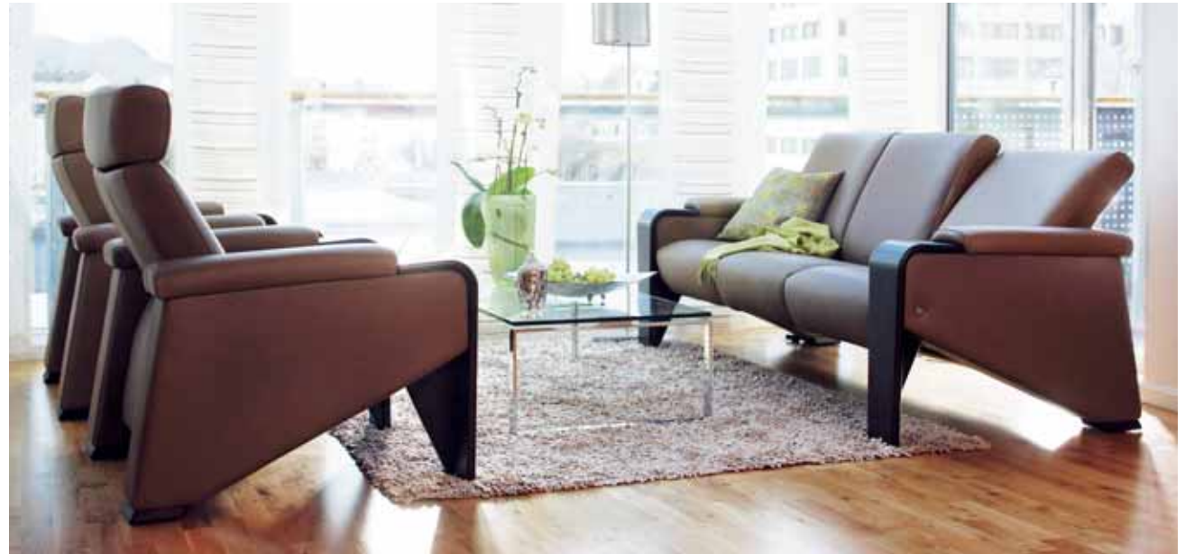
Stressless® Sphinx 2007 high back chairs and 3 seater low back reclining sofa.