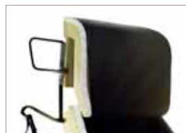
12 Individual comfort