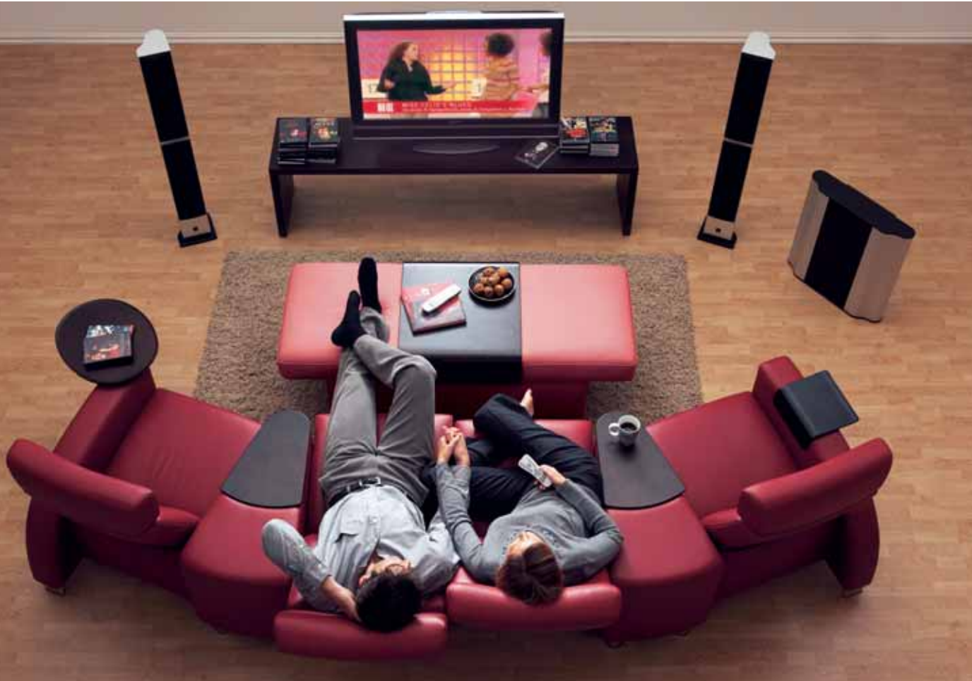
Stressless® Arion 2007 roomset with new sector arm table and double ottoman with optional table.

It makes even more sense to plan your home cinema with Stressless® sofas and recliners in mind. With individually adjustable seats, courtesy of the perfectly balanced glide system, correct neck and lumbar support provided by the Plus™ system, and height-adjustable headrests, Stressless® is the best TV furniture ever. The double ottoman featured with optional table, provides an ideal 3 in 1 mix of footstool, table and storage space all in one unit!