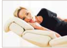
4 Start with the Comforttest™