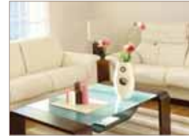
5 The comfortable combination