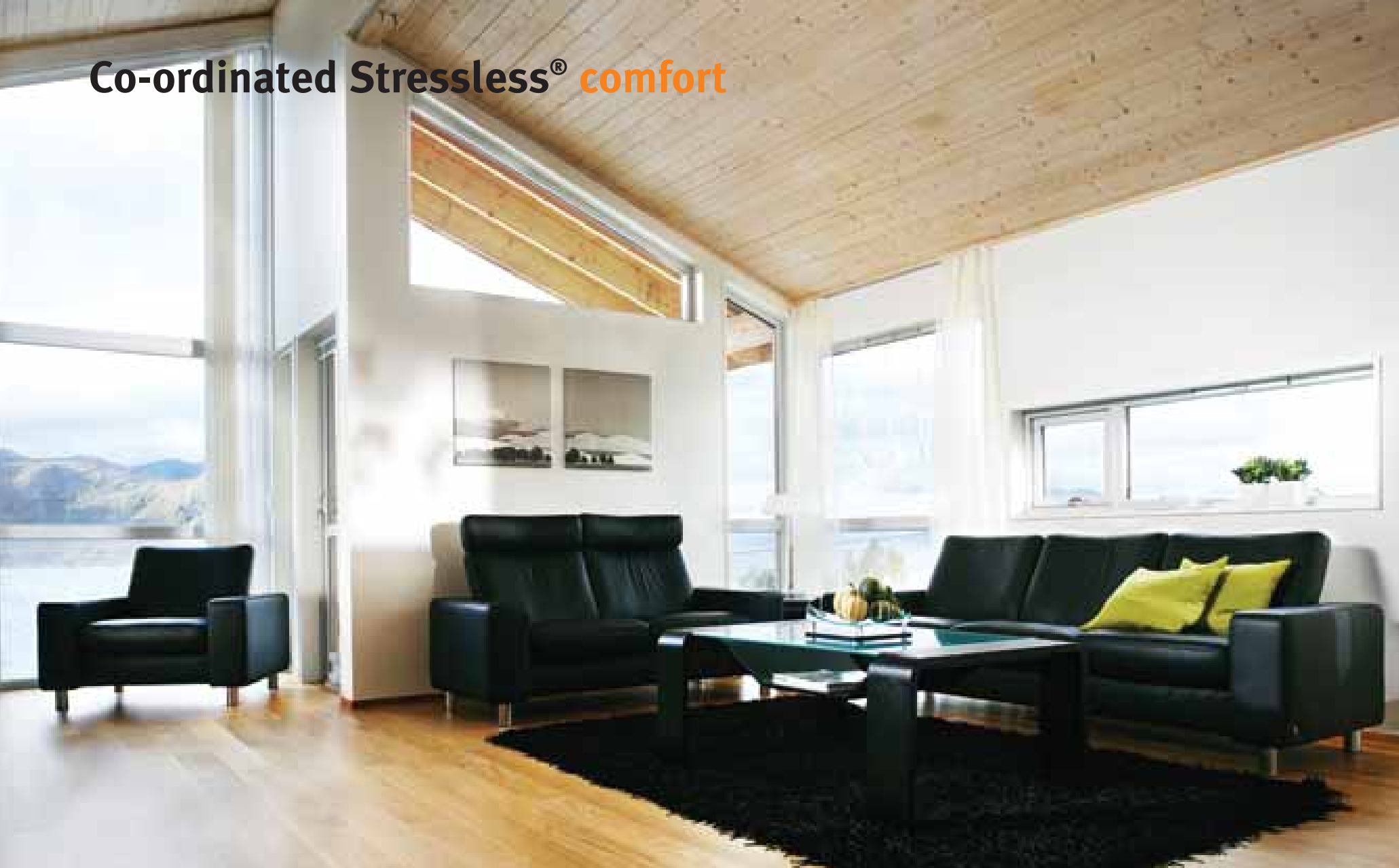
Stressless® Space low back reclining chair, Space high back 2 seater and low back 3 seater reclining sofas.