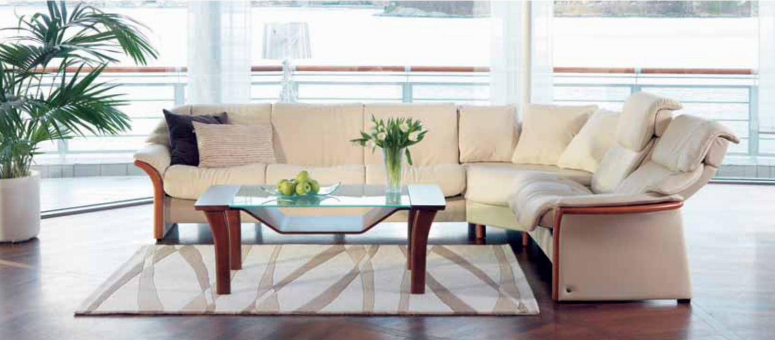
Stressless® Granada 2007 with new medium corner unit.