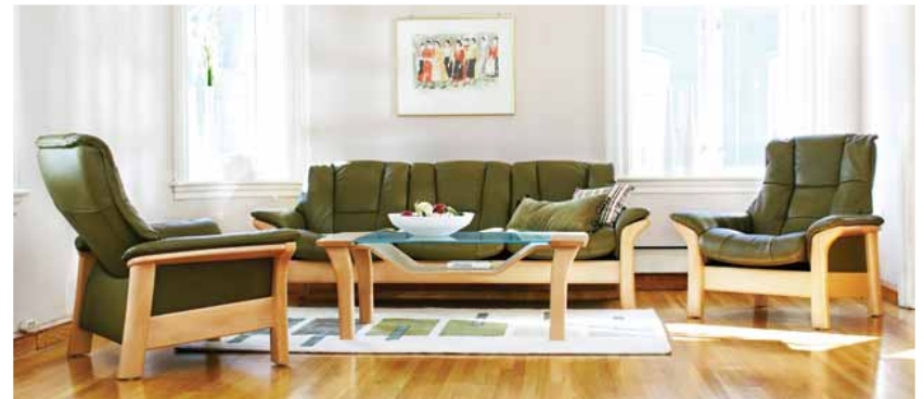
Stressless® Buckingham roomset.

Now it's easy to find a design to suit your individual requirements as Stressless® Windsor and Buckingham are matching designs but with different seat sizes so as you arrange your living room and personal comfort without compromise.