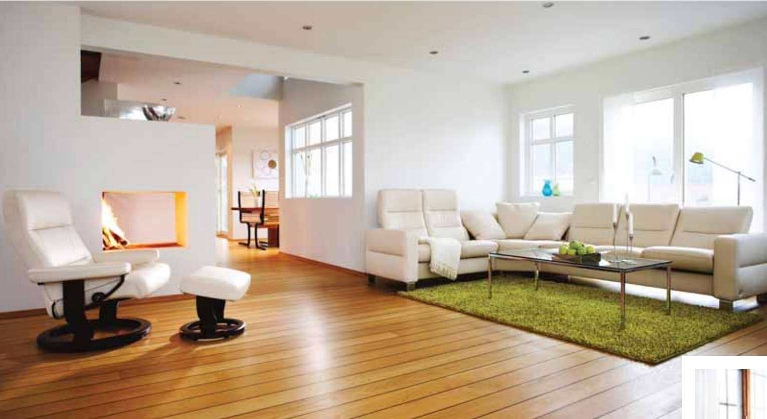
Stressless® Wave roomset with new medium corner unit and Pacific recliner with foot stool.

Five individually adjustable seats – two high backs and three low backs, with a fabulous big corner in the middle. With all these combinations you'll never want to get up.