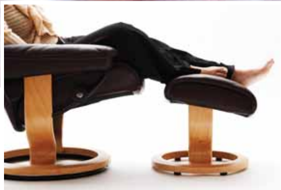
Tilting Stressless® Kensington footstool.

Stressless® Westminster 3 seater reclining sofa and Stressless® Kensington recliner with footstool.