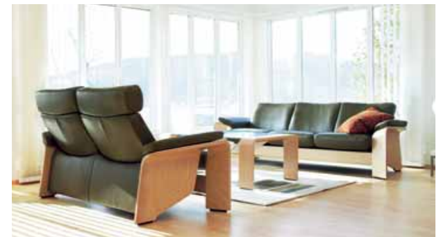
Stressless® Pegasus 2 seater high back and 3 seater low back reclining sofas.