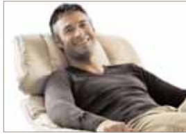
3 The Innovators of Comfort™