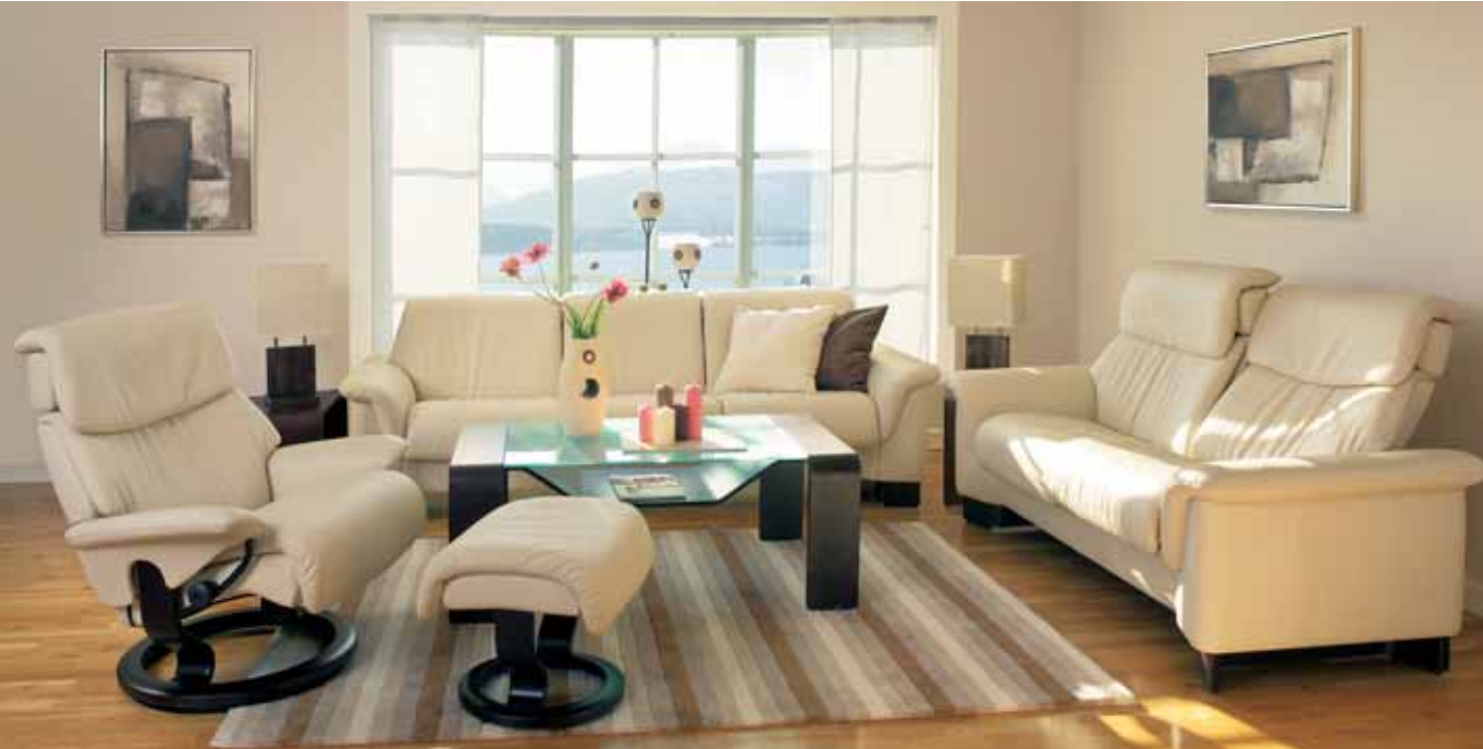
Stressless® Dream recliner and foot stool with Stressless® Paradise low back 3 seater and high back 2 seater sofas.

The Stressless® Paradise is available in a variety of combinations, all with individually adjustable seating in both high back and low back sofas. But unique Stressless® comfort is the one thing that always remains the same, whichever combination you choose. Paradise corner comes in large and medium.