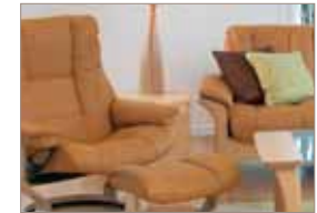
10 Matching designs means more comfort