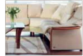
6 Size matters with a choice of sofa sizes